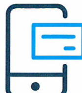
Mobile & Tablet Solutions