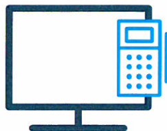
Integrated POS Solutions