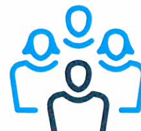
Loyalty Solutions & Merchant Cash Advance

Tailored Solutions to grow and manage your business one transaction at a time.